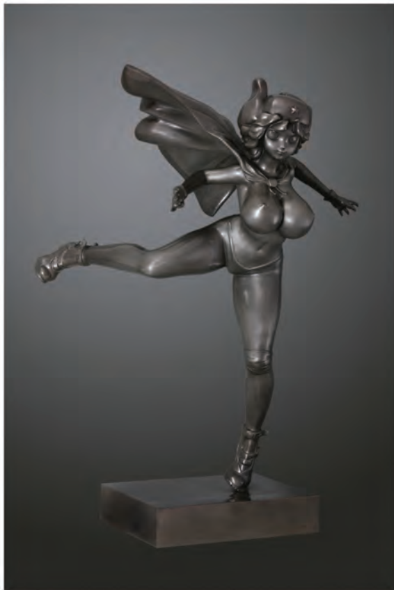
Hou Guanbin - Beautiful Girl No.1, 2008 125 x 80 x 65 cm, bronze