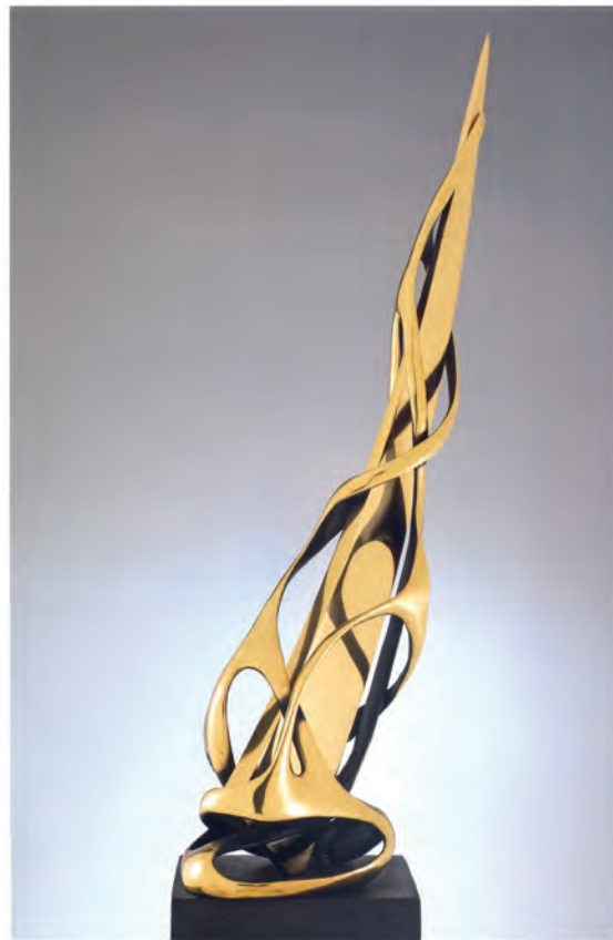
Gianfranco Meggiato - Sheran Blade, 2008 H: 95 cm, bronze